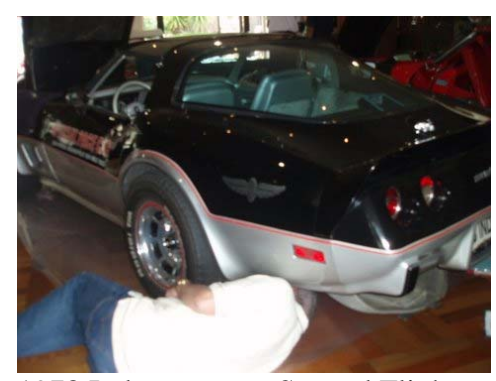
1978 Indy pace car, Second Flight