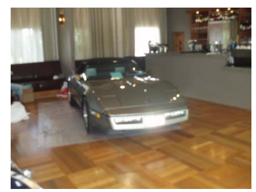
1986 convertible, Top Flight