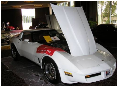
Bryan Wharton 1980 coupe, Top Flight