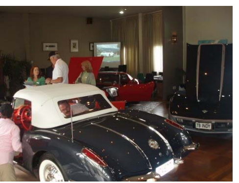
1958 convertible, Top Flight