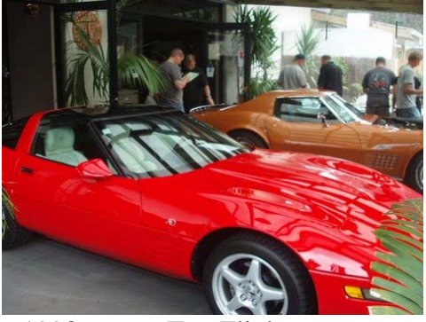
1993 coupe, Top Flight