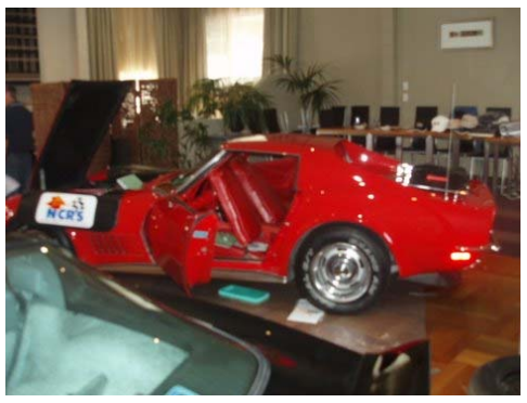
1972 coupe, Top Flight