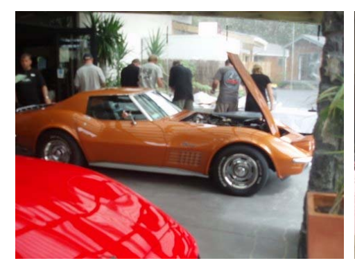
1972 coupe, Second Flight